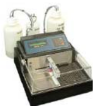
Neogen automated plate washer (6718)