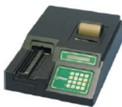
Neogen microwell reader (9302)