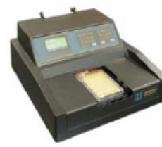
Neogen microplate reader (6704)